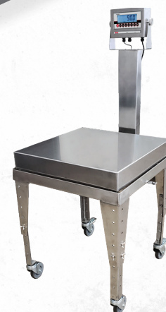
OPTIONAL HEIGHT ADJUSTABLE BENCH SCALE CART