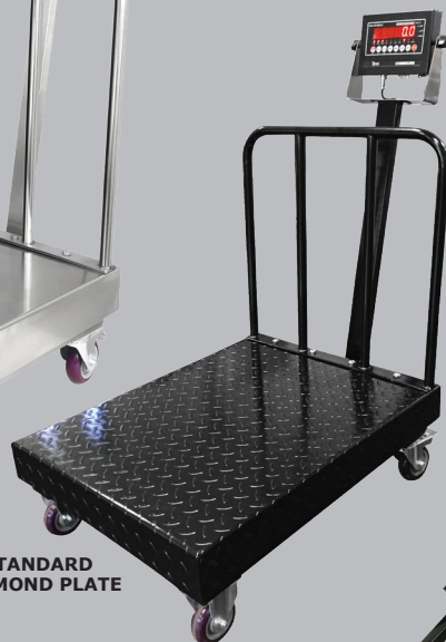
STANDARD DIAMOND PLATE