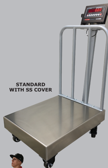
STANDARD WITH SS COVER