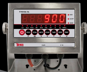
T900A-SL LED NEMA 4X WASHDOWN STAINLESS STEEL