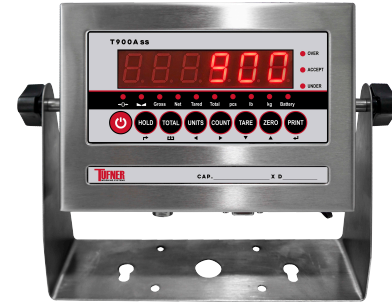
T900A-SS LED STAINLESS STEEL