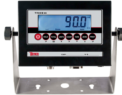
T900B-MS LCD PAINTED CARBON STEEL