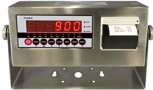
T900P BUILT-IN PRINTER