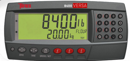
8400 VERSA PANEL MOUNT