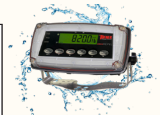
OPTIONAL 8200 REPEL IP69K INDICATOR