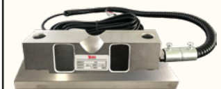
LOAD CELL WITH RODENT PROOF SHROUDED CABLE