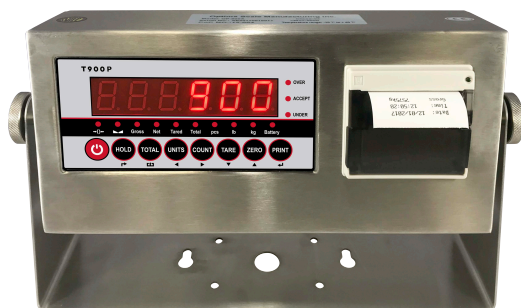
T900P BUILT-IN PRINTER