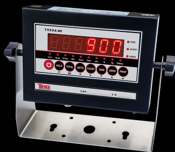
T900A-MS LED PAINTED MILD STEEL