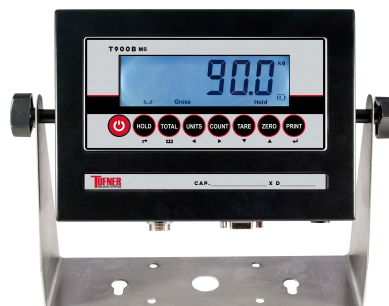
T900B-MS LCD PAINTED CARBON STEEL