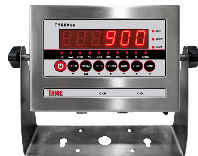
T900A-SS LED STAINLESS STEEL