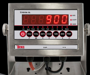
T900A-SL LED NEMA 4X WASHDOWN STAINLESS STEEL