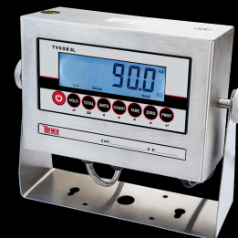
T900B-SL LCD NEMA 4X STAINLESS STEEL