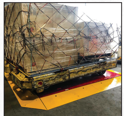
IDEAL FOR WEIGHING CARGO LOADS