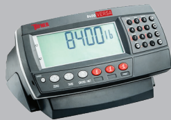
8400 VERSA INDICATOR UPGRADE