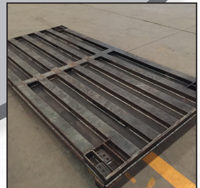
CONTINUOUS WELDING MULTIPLE STEEL CHANNELS